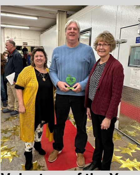
Volunteer of the Year